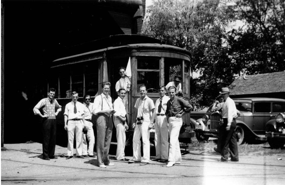
Interurban No. 23 was used for the trip to the Boys Industrial School. Half the car is still in the car barn.