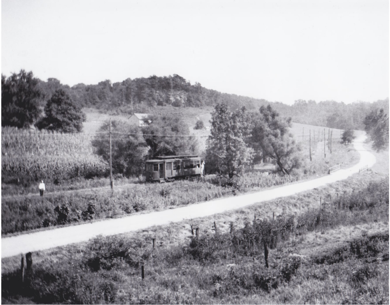
A photo stop on the line from Lancaster to the Boys' Industrial School. The line was built by the Fairfield Traction Co., later it was consolidated with the Lancaster Traction & Power Co.