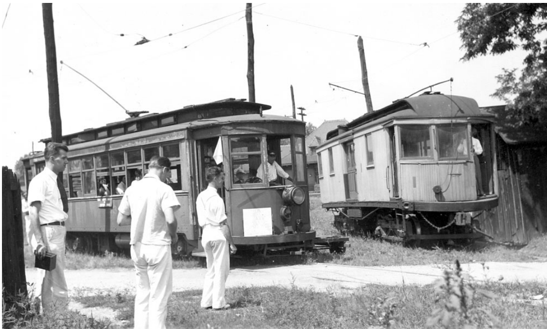
The excursion has stopped at the Hocking Valley Railroad interchange. Lancaster Union Station is behind freight Motor No. 1.